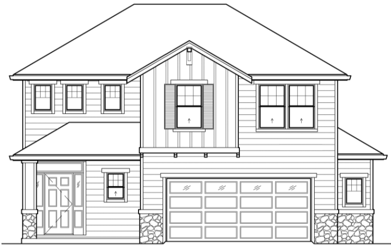
1848 ELEVATION A